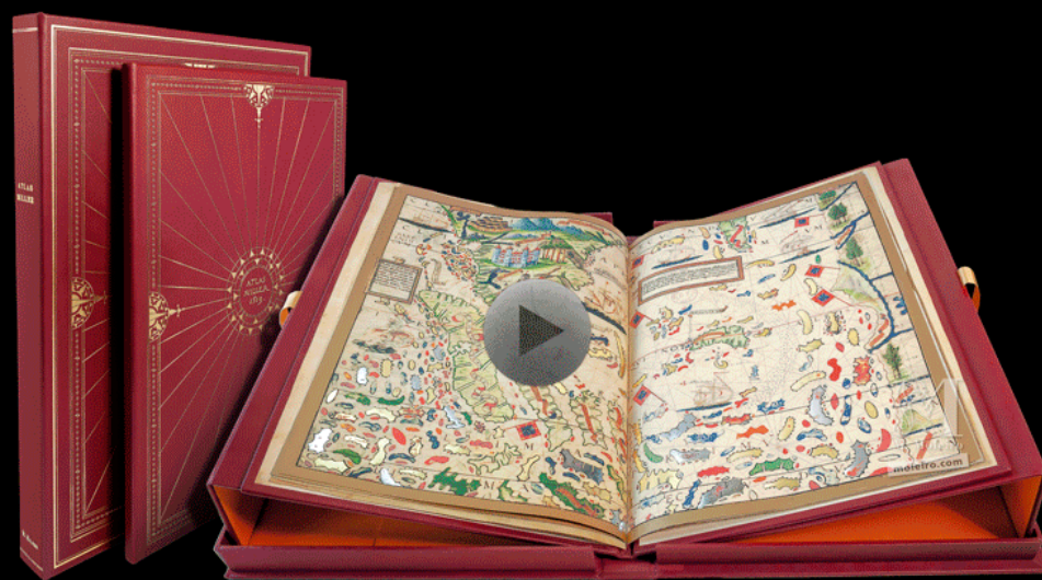
Atlas Miller, 1519–1522

The superb quality bindings match the exquisite contents and the accompanying commentary volumes provide an in-depth analysis.